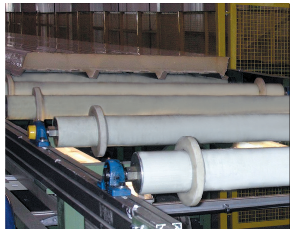
Non-marking surface protects products